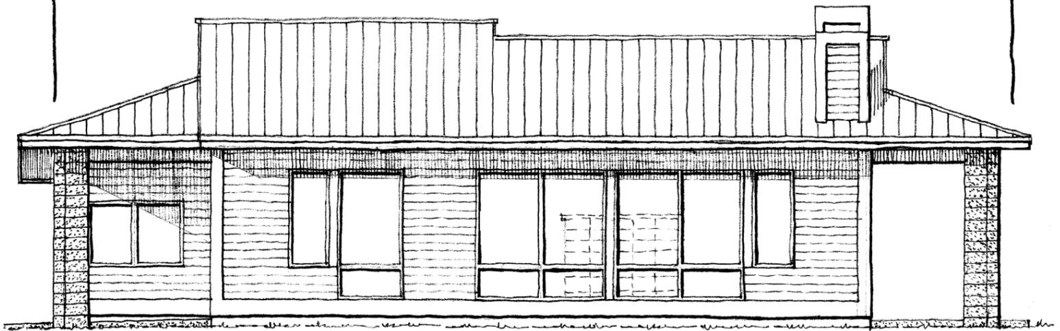
□ SOUTH ELEVATION □